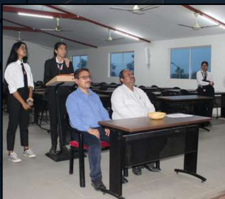
The draw of lots and exchange of memorial by the faculty members in 1st online national Moot Court Competition held in 2022.