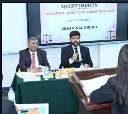
The courtroom alive with energy as the competition rounds unfolded. Judges posed challenging questions, and the speakers responded with sharp, law-driven arguments. Their composure and intelligence showcased true legal talent, making the event a remarkable display of skill and wit.